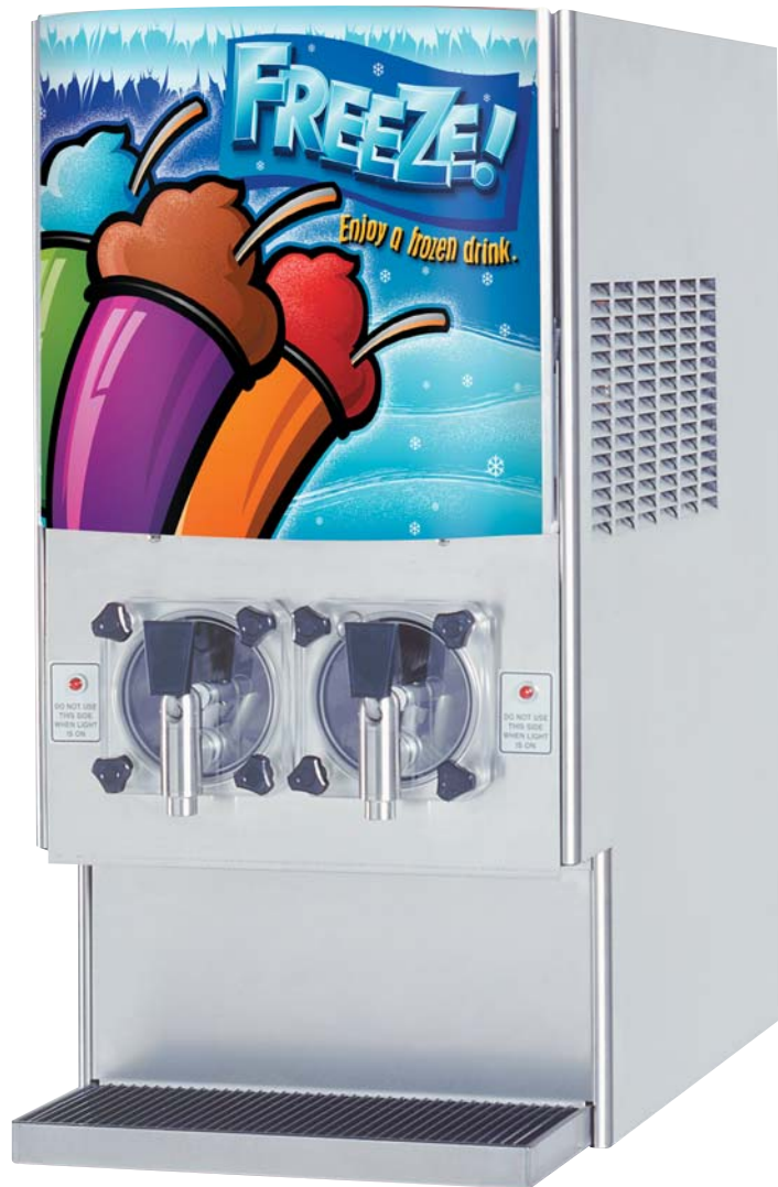
Unit Shown With Optional Base Cart