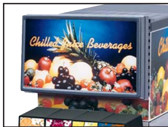
Optional Lighted Marquee Kit