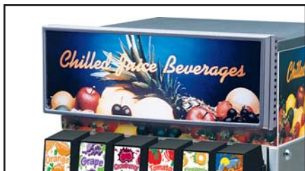
Optional Lighted Marquee Kit