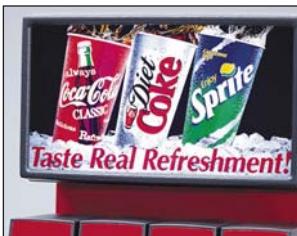
Optional Lighted Marquee